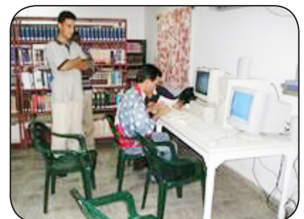
Right: Seminary classroom