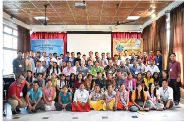
Transforming Leaders in Asia retreat participants.

Evangelical leaders in Estonia are focused on raising up and equipping emerging leaders in their country. FLF is providing funding and leadership training for five weekend training intensives throughout 2020 and beyond. Pray for the 16-24-year-old emerging leaders from the churches who are following God’s call on their lives.